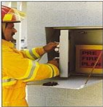
High Security Storage